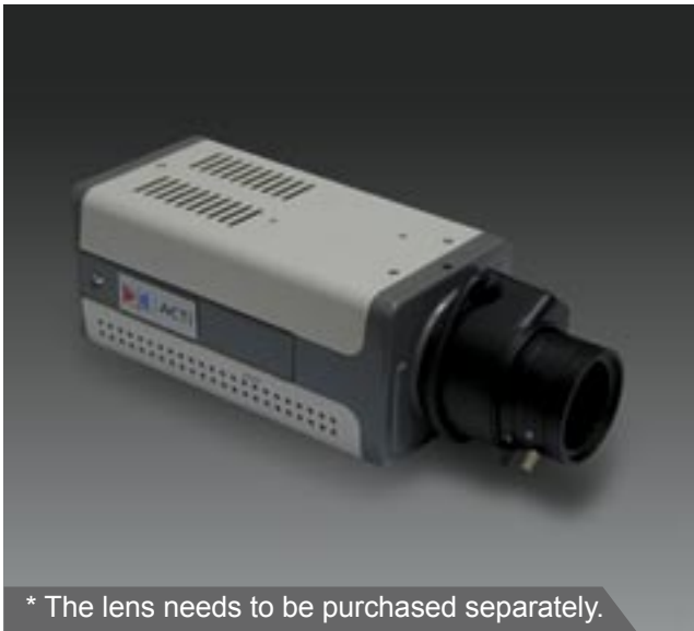
* The lens needs to be purchased separately.