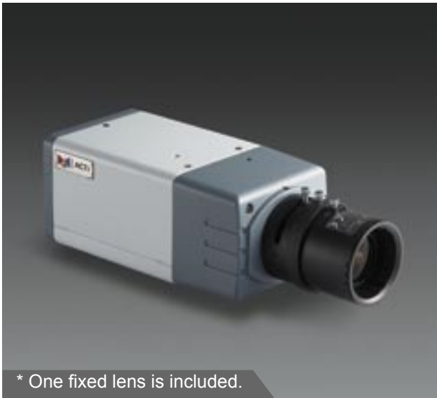
* One fixed lens is included.