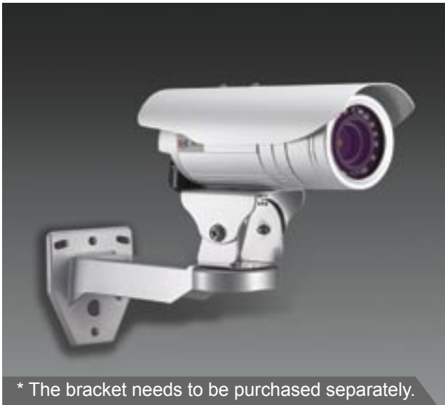
* The bracket needs to be purchased separately.