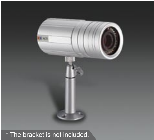
* The bracket is not included.