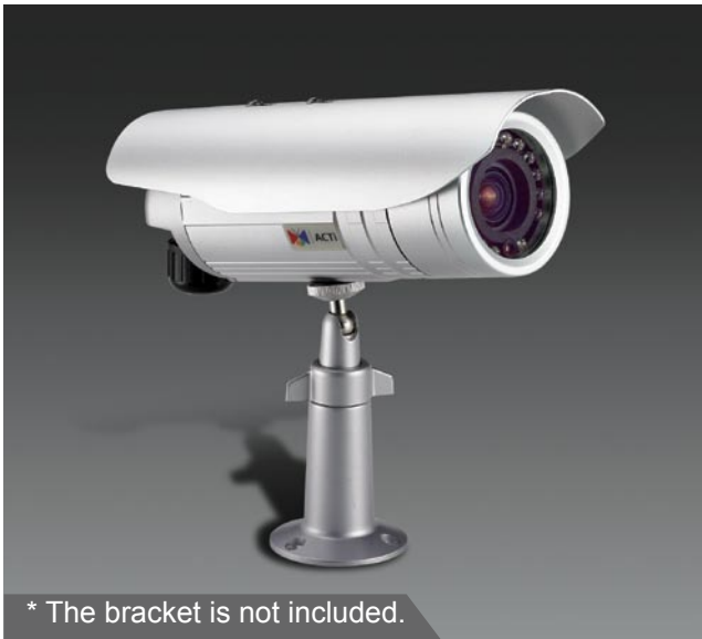
* The bracket is not included.